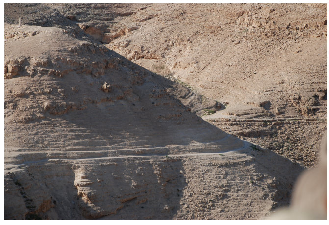
— The Jericho Road —