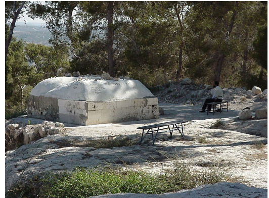
THE TOMB OF SAMSON