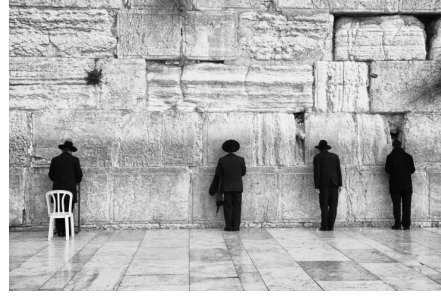
ASHLARS AT THE WESTERN WALL, TEMPLE MOUNT