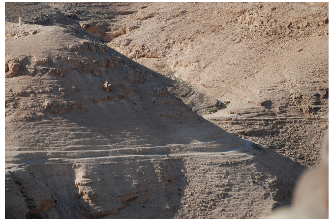
— The Jericho Road —