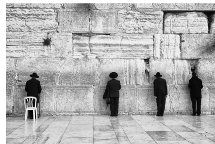
ASHLARS AT THE WESTERN WALL, TEMPLE MOUNT