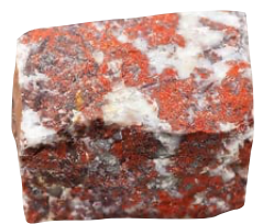
Jasper, opaque quartz, red and green colors were high value stones