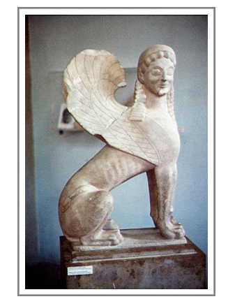
A Corinthian Sphinx