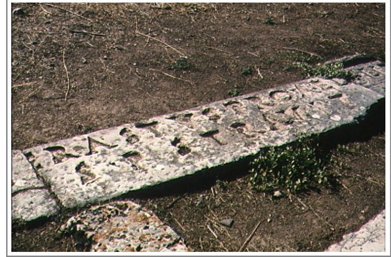
Erastus paving memorial