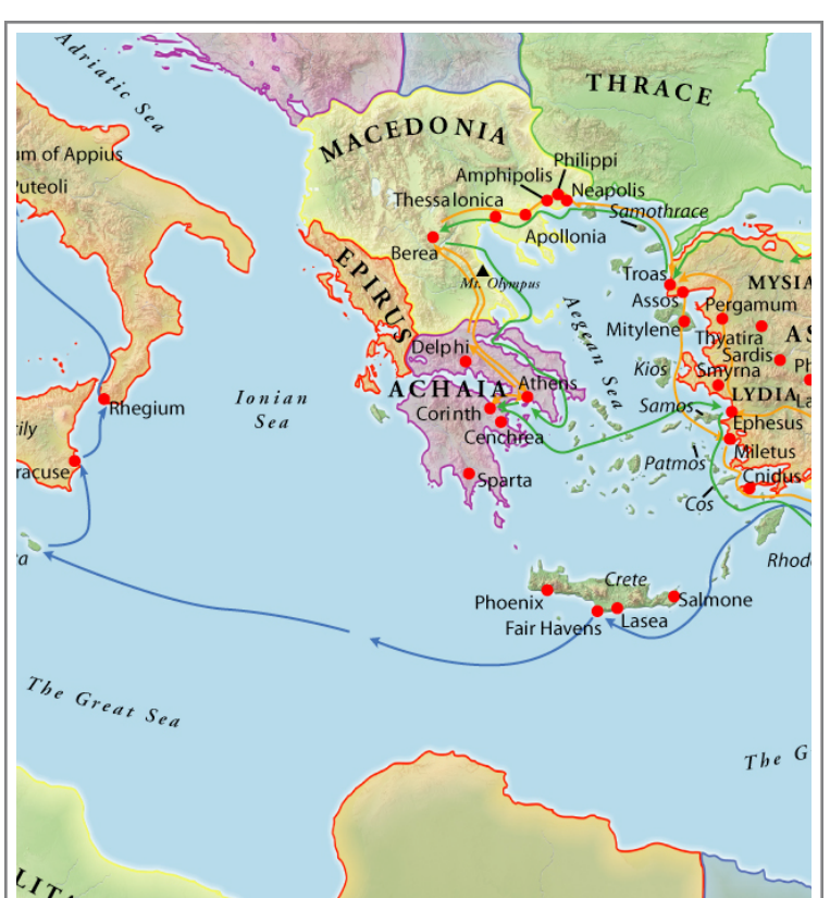
Map of the central Mediterranean