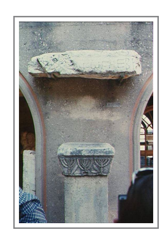
Corinthian synagogue lintel